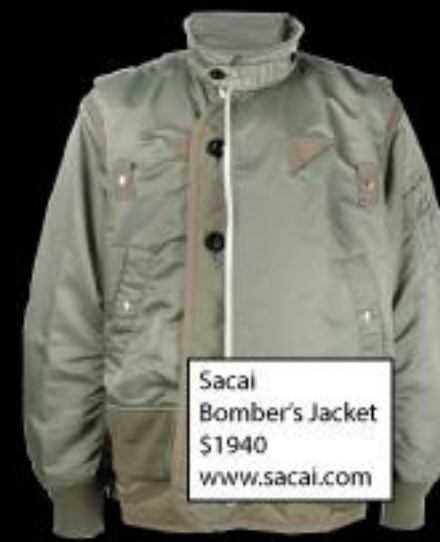
Sacai Bomber's Jacket $1940 www.sacai.com