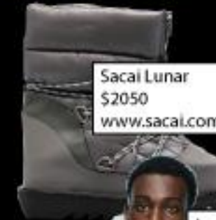
Sacai Lunar $2050 www.sacai.com