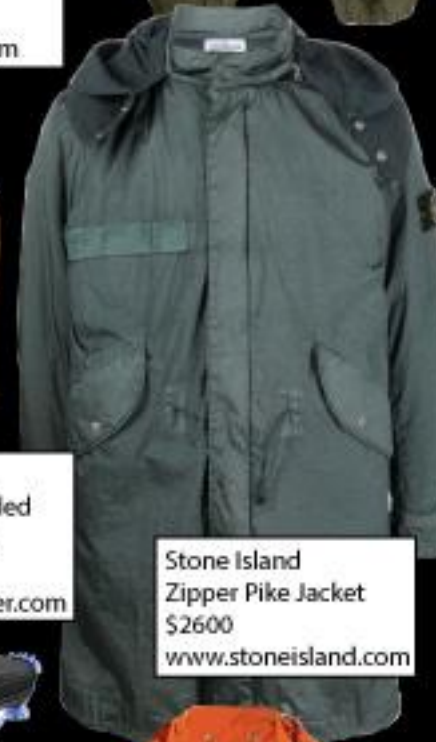
Stone Island Zipper Pike Jacket $2600 www.stoneisland.com