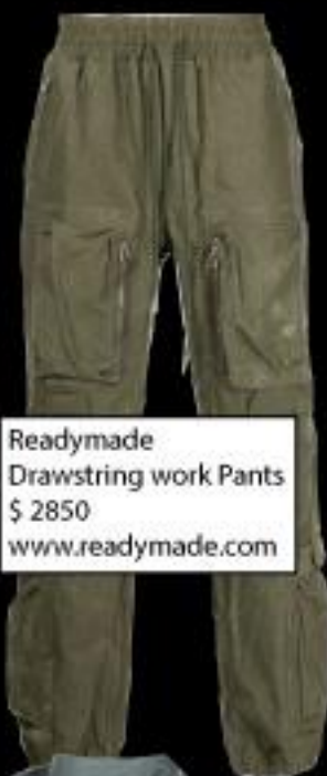
Readymade Drawstring work Pants $ 2850 www.readymade.com