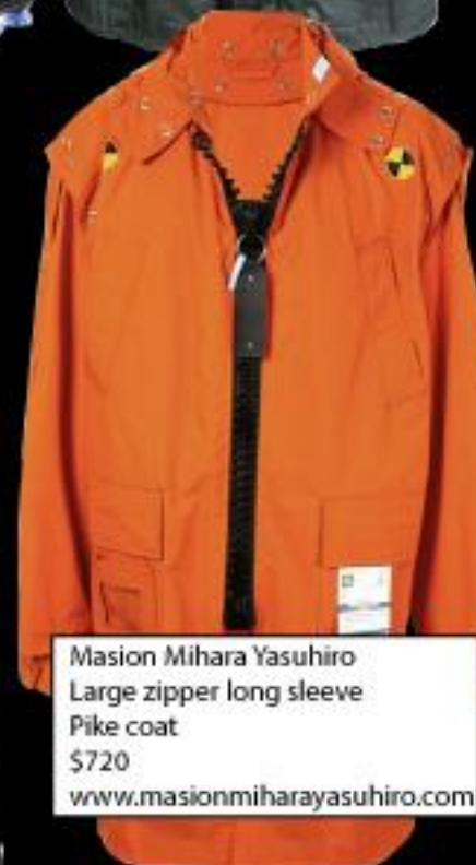
Masion Mihara Yasuhiro Large zipper long sleeve Pike coat $720 www.masionmiharayasuhiro.com