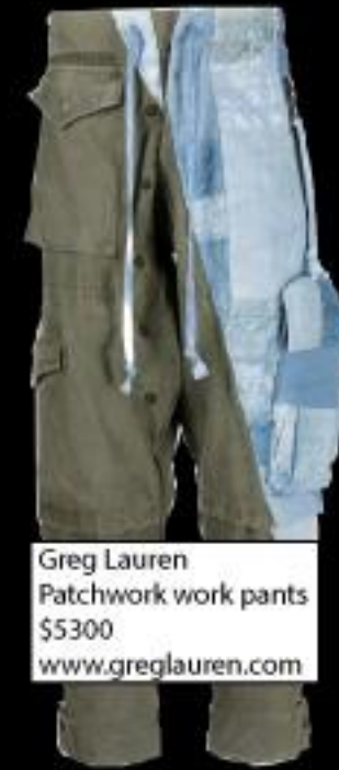
Greg Lauren Patchwork work pants $5300 www.greglauren.com