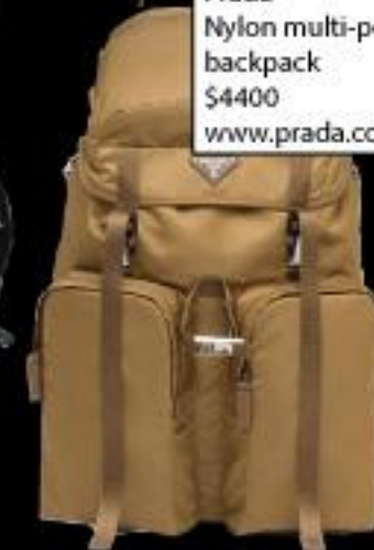
Prada Nylon multi-pocket backpack $4400 www.prada.com