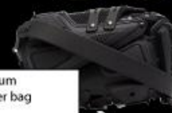
Innerraum shoulder bag $1200 www.innerraum.com