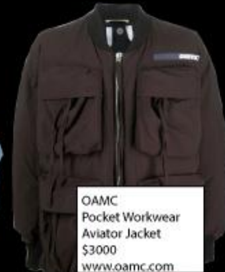
OAMC Pocket Workwear Aviator Jacket $3000 www.oamc.com